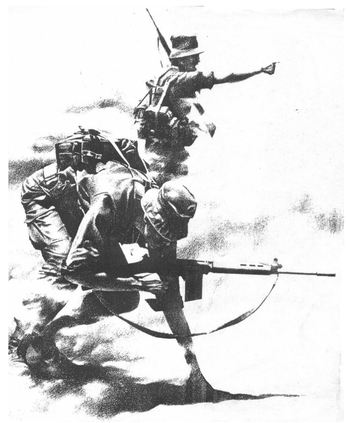
I can't remember where I found this sketch, or who drew it, but it shows nicely a South African R1 FAL

Schneider Machine "Sling Thingy." A plate that fits between the rear of the lower receiver and the stock that allows the attachment of a side mounted sling (slot on L side, eyelet on right side). Nicely made. Precludes use of tang screw, or requires re-drilling of tang screw hole.