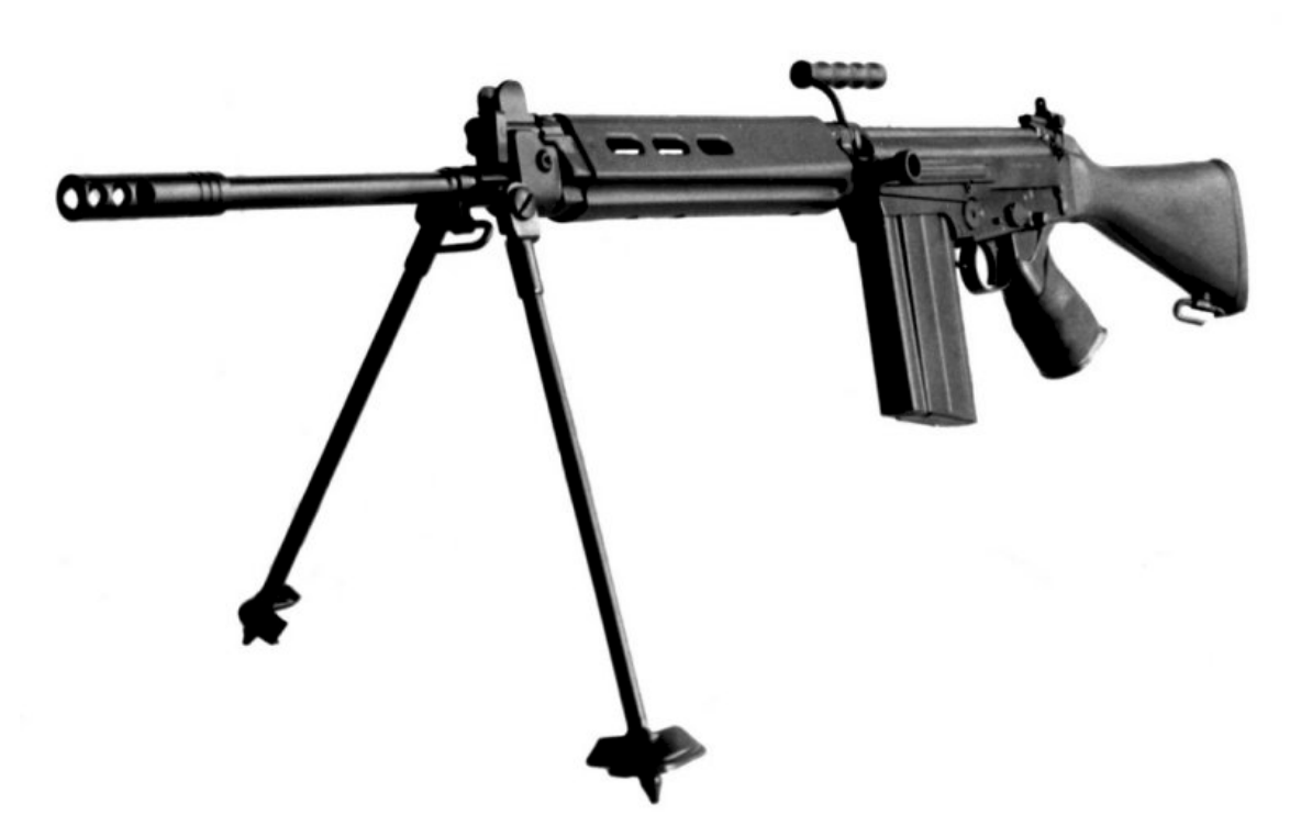
Post-Ban FAL Built with DSA Type I receiver by Arizona Response Systems

You may also choose to remove the material from the inside of the cocking handle by carefully filing or cutting on a mill. While more difficult, this method is safer as it modifies the least expensive part. The long "slide" portion of the cocking handle may need to be reduced slightly in height or width to move freely. Height can be adjusted by holding flat on a belt sander. Width and fine adjustments should be done by careful hand filing or sanding. If close, but still binding slightly, coat with a lapping compound and work back and forth until it moves smoothly.