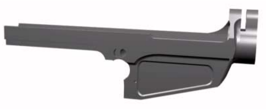
Type I receiver

L1A1s come with a washer that fits inside the flash hider so when tightened on, the flash hider indexes properly. The thickness of this washer controls the point of indexing. Although not absolutely necessary, it eliminates the slight wobble you may experience without it, as would judicious application of permanent thread-locking compound. Take a .308" drill rod and insure that your hider is aligned. If not, drill it out so you don't shoot it off.